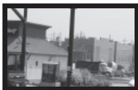
Cinemark, near the old Montgomery Ward store

State Road Shopping Center is gone and in its place will be the Portage Crossing. The buildings are beginning to take shape with a completion date of the fall of 2014. Some of the businesses involved are Giant Eagle Market District, Cinemark, Best Cuts, Fashion Nails, LA Fitness, Pet Supplies Plus, Chipotle, Menchie's Frozen Yogurt, Aladdin's Eatery, Burger Fi and the Huntington Bank. The old State Road Shopping Center was demolished in 2009 and it's taken some time but change is coming.